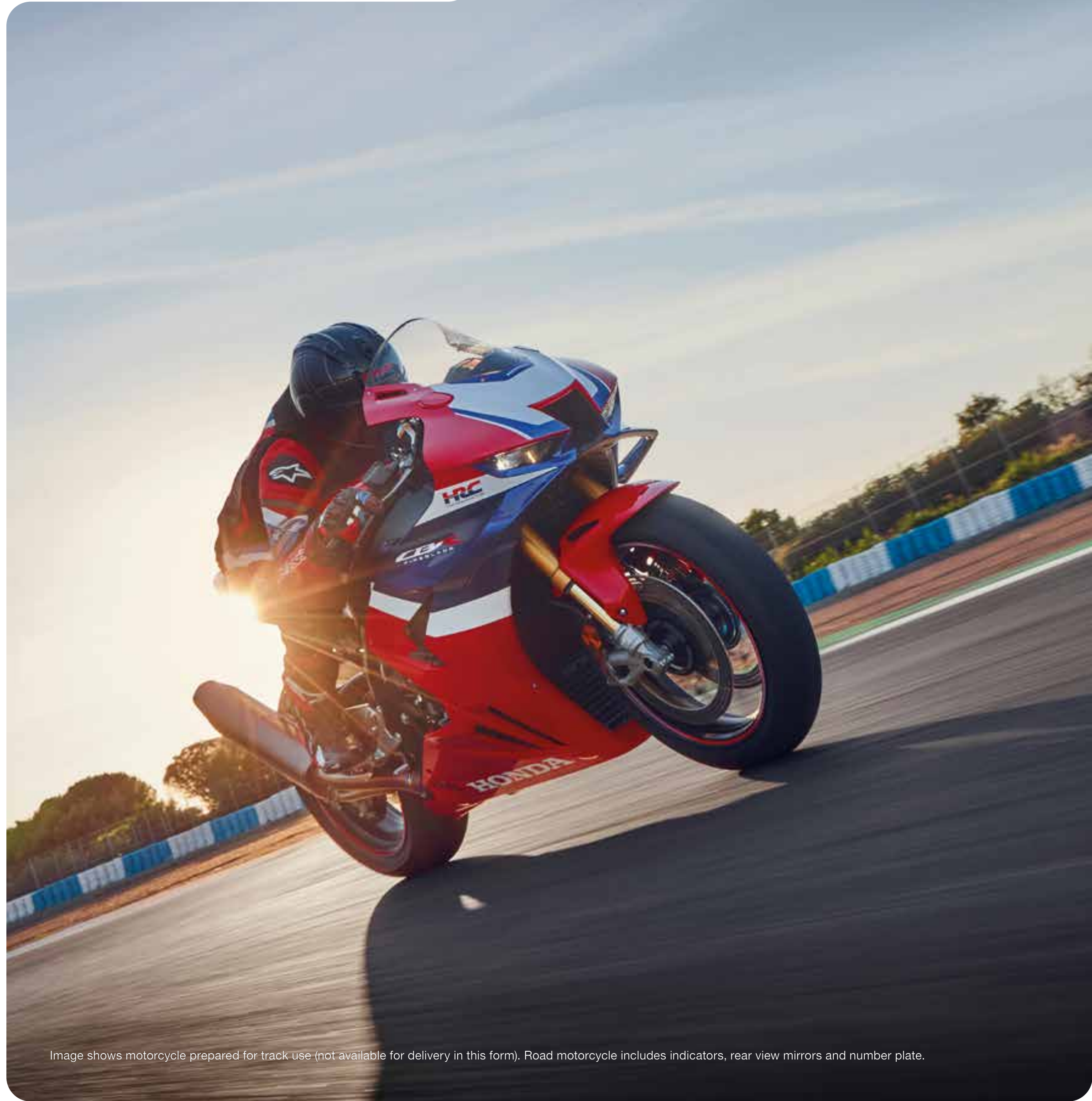
Image shows motorcycle prepared for track use (not available for delivery in this form). Road motorcycle includes indicators, rear view mirrors and number plate.