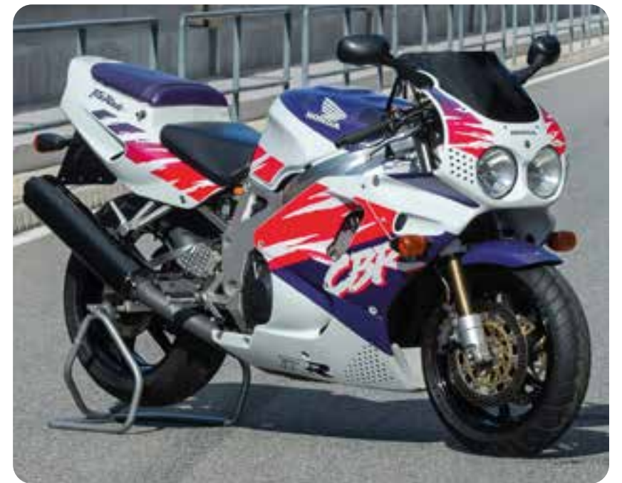
The CBR900RR Fireblade that started all.

More than 25 years after, the most powerful and nimble Honda bikes keep carrying the Blade legacy.