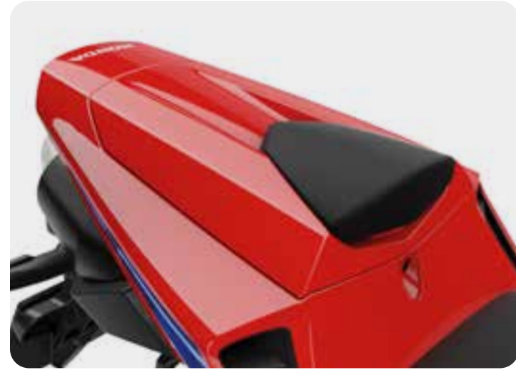
SEAT COWL 08F70-MJC-N30ZA €233.00 €210.00 08F72-MJC-N40ZA €223.00 €201.00

This stylish Single Seat Cowl replaces the pillion seat with an easy operation, creating a strong resemblance to the racing machine and reducing the weight. It cannot be used in conjunction with the Seat Bag. Available in the following colour options: