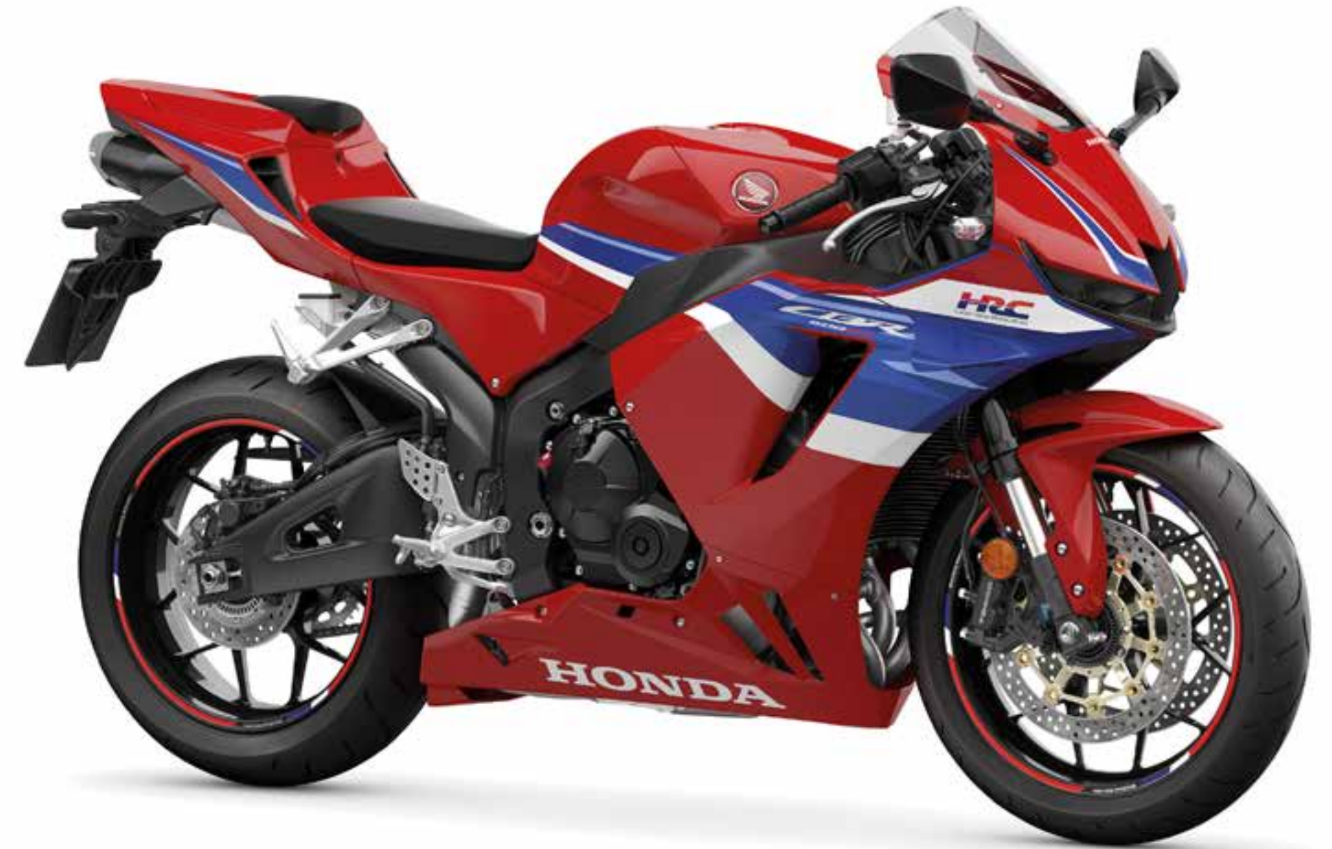
The CBR600RR in action.