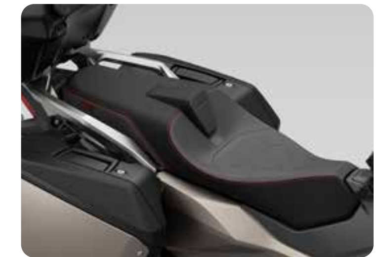
COMFORT SEAT *BLACK* 08R71-MKT-D70ZA

The deflector set enhances rider comfort by reducing airflow around the waist and lower body.