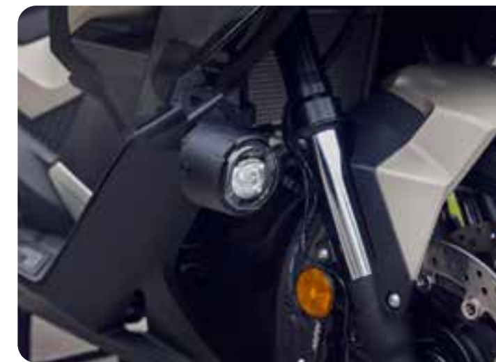
FOG LIGHTS KIT 08ESY-MKV-FLS

Note: The kit includes a specific gasket for either X-ADV or FORZA 750, read the instructions carefully.