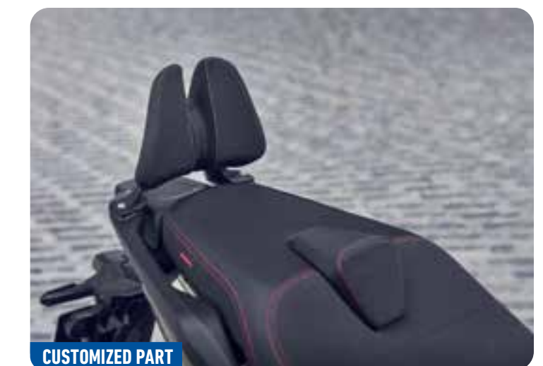
PASSENGER BACKREST OR24M-MSE-009