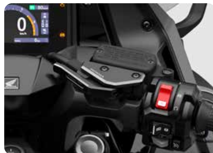
PARKING LEVER COVER 08F72-MKT-D00