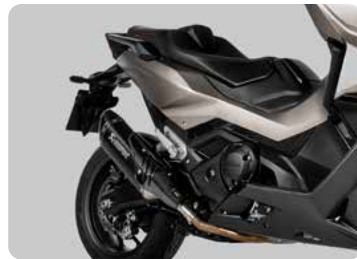
MUFFLER AKRAPOVIC OR24M-SMU-D27