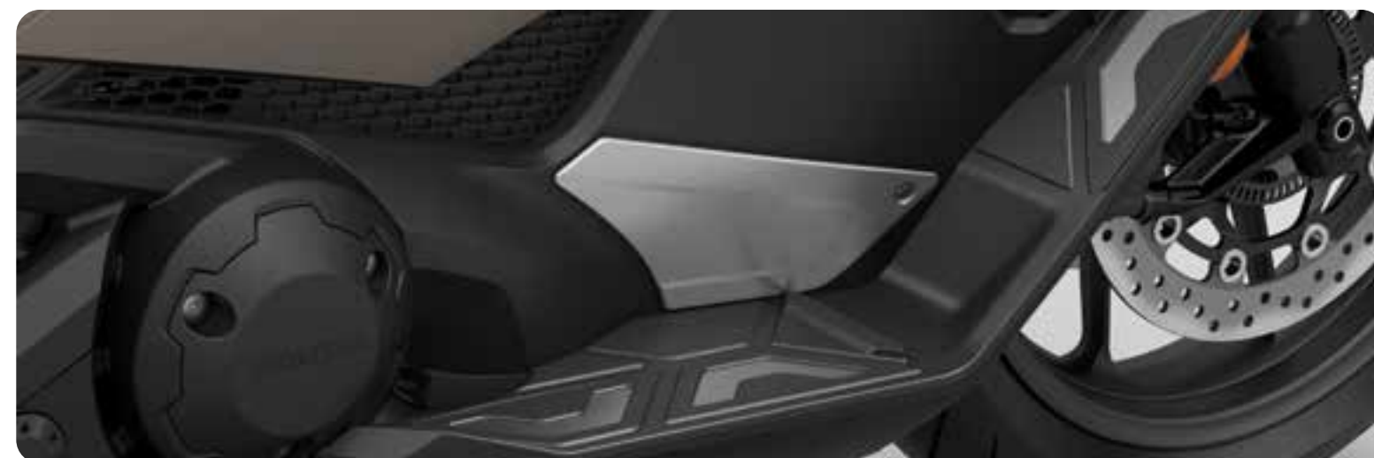
LATERAL COVERS 08F71-MKV-D00