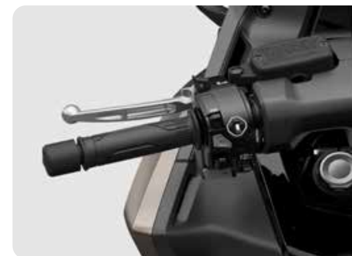
GRIP HEATER 08T70-MKT-D70