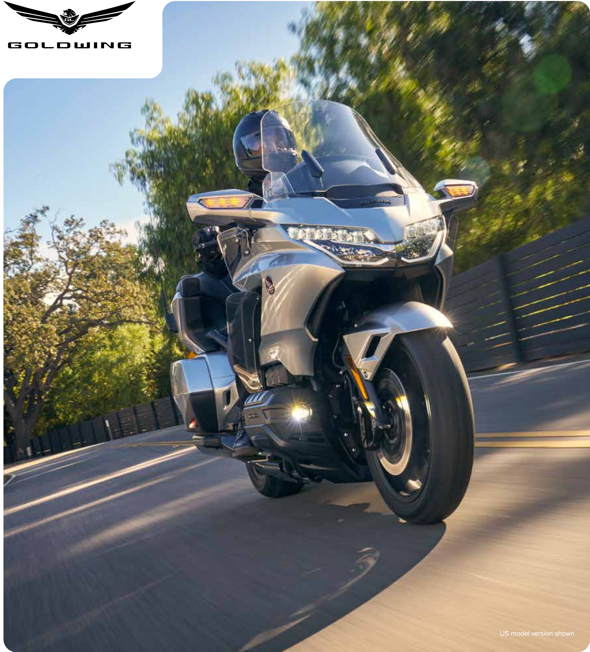
US model version shown