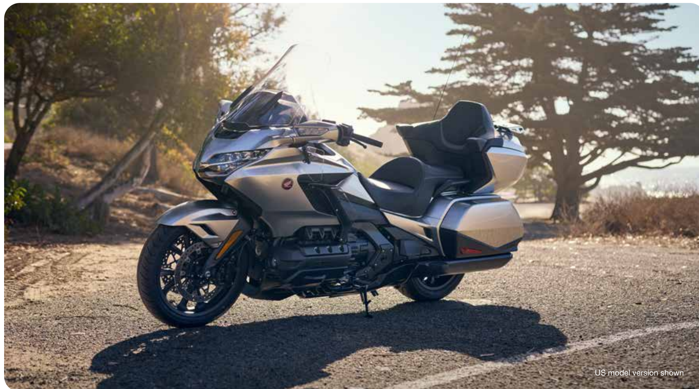
US model version shown

WHEEL STRIPES 08F71-MKC-A10ZA €146.00 €131.00 Easy to apply wheel decal kit. Red colour-accented vinyl stripes feature Gold Wing logo for a custom appearance. The Wheel Stripes kit enhances the design of the Gold Wing while adding some protection and being easy to install. Available in the following colours: • Candy Prominence Red 08F71-MKC-A10ZA • Indi Gray Metallic 08F71-MKC-A10ZB (shown) • Orange 08F71-MKC-A10ZD